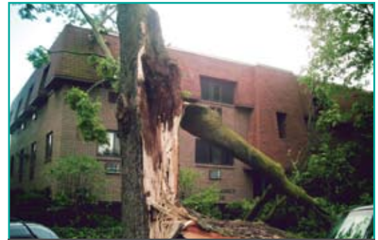
Fortunately, Sasser Family House sustained only minor roof damage when a tree fell on the building during a recent storm.